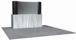
TABLE TOP UNIT

For fast, easy ordering, go to www.freemanco.com/store